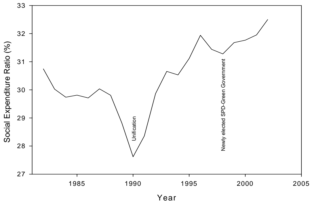
Figure 2: Social Expenditure Ratio (1980-2002)